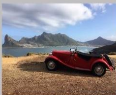
2020 - MGTD 1950 turned 70!