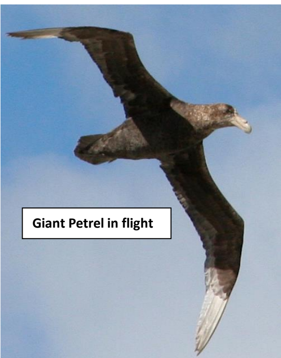
Giant Petrel in flight